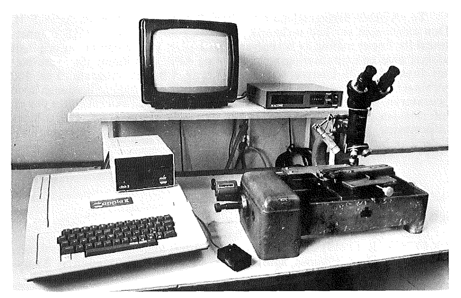
Fig. 1. The older ADDO, the MACOME and the APPLE II.

A complete description of the system (partly in norwegian) and programs are available at request.