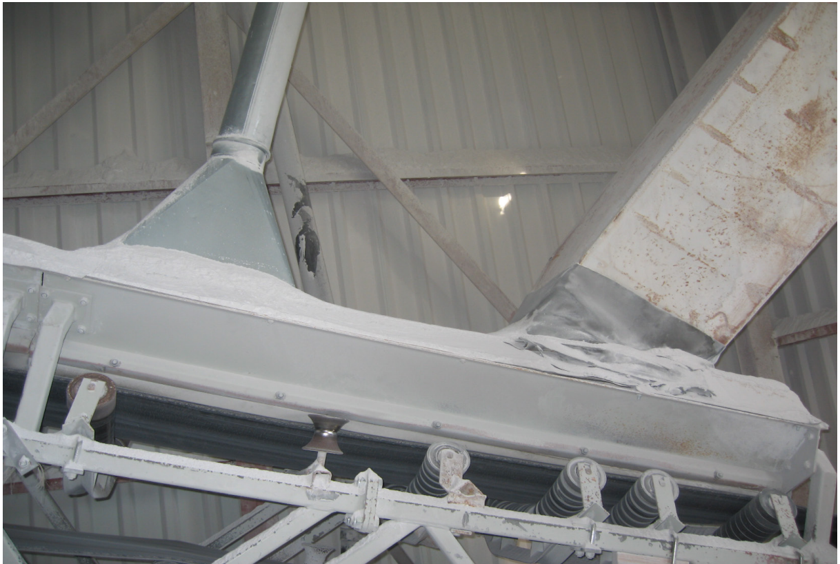
Picture 1. Example of a picture taken during an inspection

An example of picture in use is presented in Picture 1.