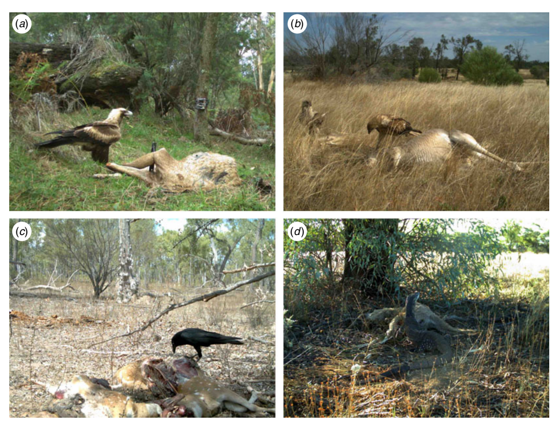
Fig. 3. Examples of Australian wildlife scavenging on the carcasses of animals shot with lead-based bullets. (a) A wedgetailed eagle ( Aquila audax ) feeds on the carcass of a shot sambar deer ( Rusa unicolor ), (b) black kites ( Milvus migrans ) feed on the carcass of a shot western grey kangaroo ( Macropus fuliginosus ), (c) an Australian raven ( Corvus coronoides ) feeds on the carcass of a shot chital deer ( Axis axis ) and (d) a lace monitor ( Varanus varius ) feeds on the carcass of a shot western grey kangaroo. The images were captured in the same way as described by Legagneux et al. (2014), namely by placing camera traps on the carcasses of shot animals (Forsyth et al. 2014).