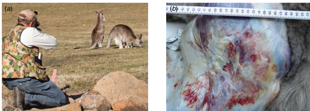
Fig. 2. Darting of adult eastern grey kangaroos ( Macropus giganteus ) for fertility control, south-eastern Australia, 2015. (a) A dart fired at the rump of a habituated kangaroo and (b) post-mortem assessment of ballistic pathology from dart impact and remote injection 5 days post-darting.

Before operational use of adult seal shooting, to our knowledge, no research trials (benchtop, post-mortem or pilot studies) were undertaken to determine the effectiveness of different firearm-bullet configurations at different distances for rendering adult seals immediately insensible. Such trials have been performed for juvenile seals (Daoust and Cattet 2004; Daoust et al. 2013) and have been associated with desirable animal welfare outcomes (absence of struck-and-lost seals and a high frequency of immediate insensibility; Daoust and Caraguel 2012). The lack of ballistic trials before the operational use of adult seal shooting is likely to have contributed to the poor animal welfare outcomes