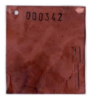
Bilden ovan visar ett exempel på perfekt blodfyllt och torkat