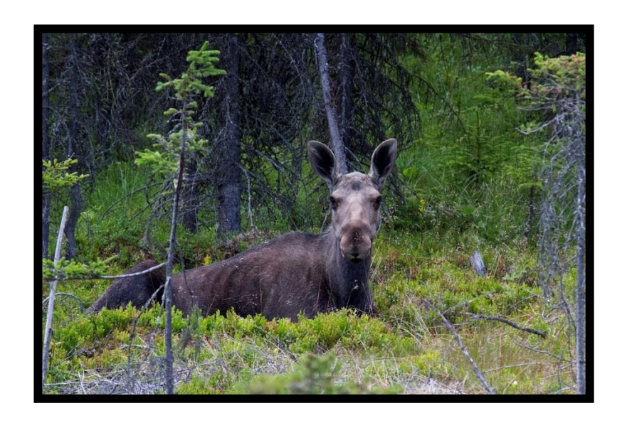
Master in Applied Ecology