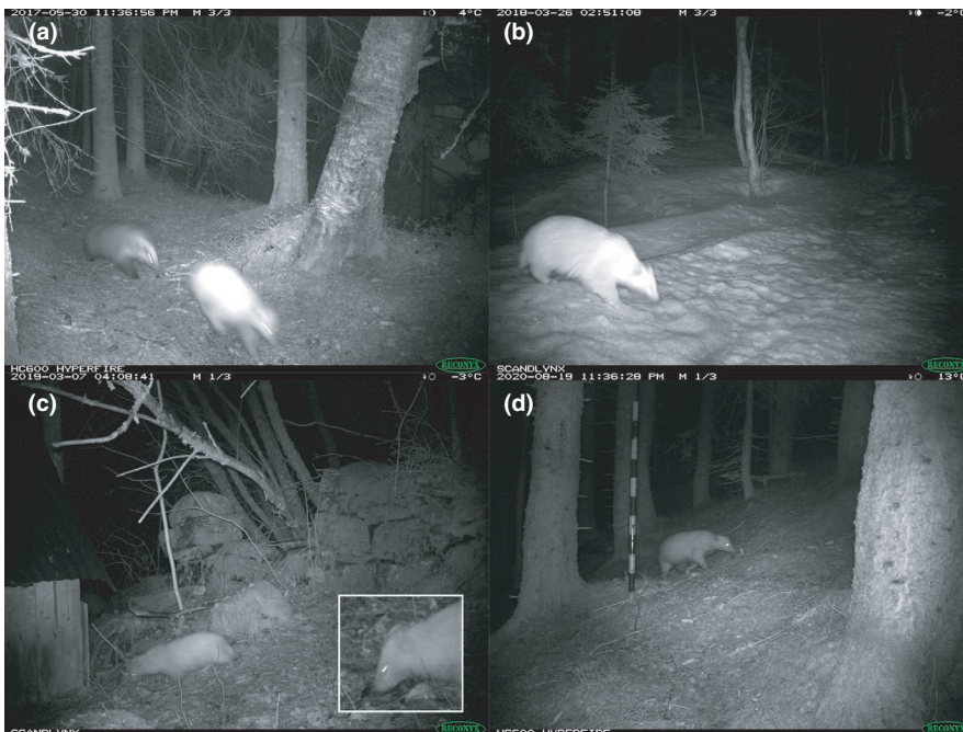
FIGURE 3 Records of leucistic Eurasian badgers ( Meles meles ) in central Norway. (a) First record of a leucistic badger in Norway. A regularly colored badger (left) chases the leucistic badger (right) showing the clear difference in coloration. (b) Second record of a leucistic badger at a different location. (c) Third record of a leucistic badger at a third location, inset: close-up of the head showing the dark nose. (d) Last record of a leucistic badger at the same location as A but from a different camera angle

and HA2 were 70 km apart, we conclude that we have observed at least two individuals.