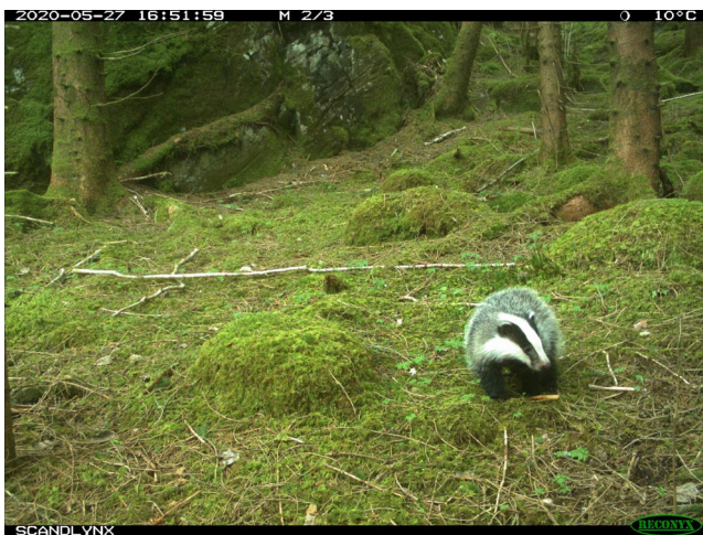
FIGURE 1 Camera trap image of a regularly colored badger from the study area, showing the distinct gray-brown body, dark legs, and black and white facial marks

The Eurasian badger normally has a distinct coat coloration with a gray-brown body, dark legs, and black and white marks on the head (Figure 1; Kruuk, 1989; Roper, 2010). Albino, leucistic, melanistic, and erythristic Eurasian badgers have been described before (Roper, 2010) and seem to occasionally be sighted in the UK (Badger Trust, 2021). However, to date these observations have not been recorded in an accessible format, such as in the scientific literature, making it difficult to assess the frequency of occurrence and study the causes and consequences of coat color anomalies in Eurasian