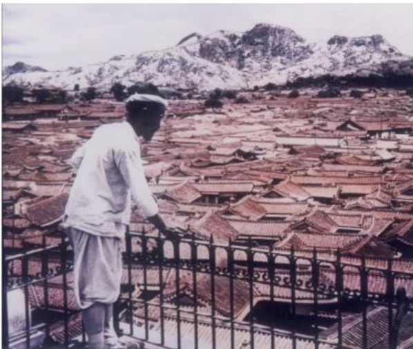
FIGURE 2 | Photograph of Seoul from the Sontag Hotel, c. 1902, close to the location of Antoinette Sontag's rooftop sighting of an urban leopard. Note the high level of urban development and the density of dwellings.

Socio-cultural factors likely also played an important role in facilitating human-leopard coexistence in this urban landscape. Contemporary accounts regularly recorded a widespread and