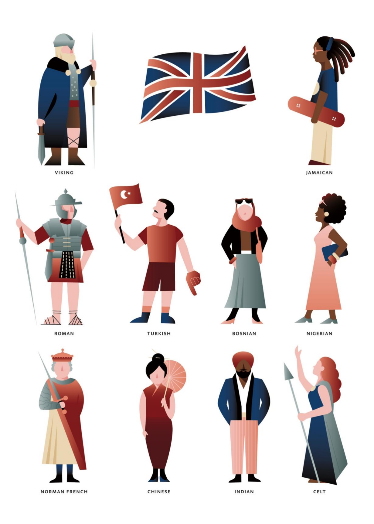
Figure 2 . A historic look at the civilization of Britain. ( No title . Illustration: Darling Clementine / byHands, from Andersen et al., 2020, p. 186)