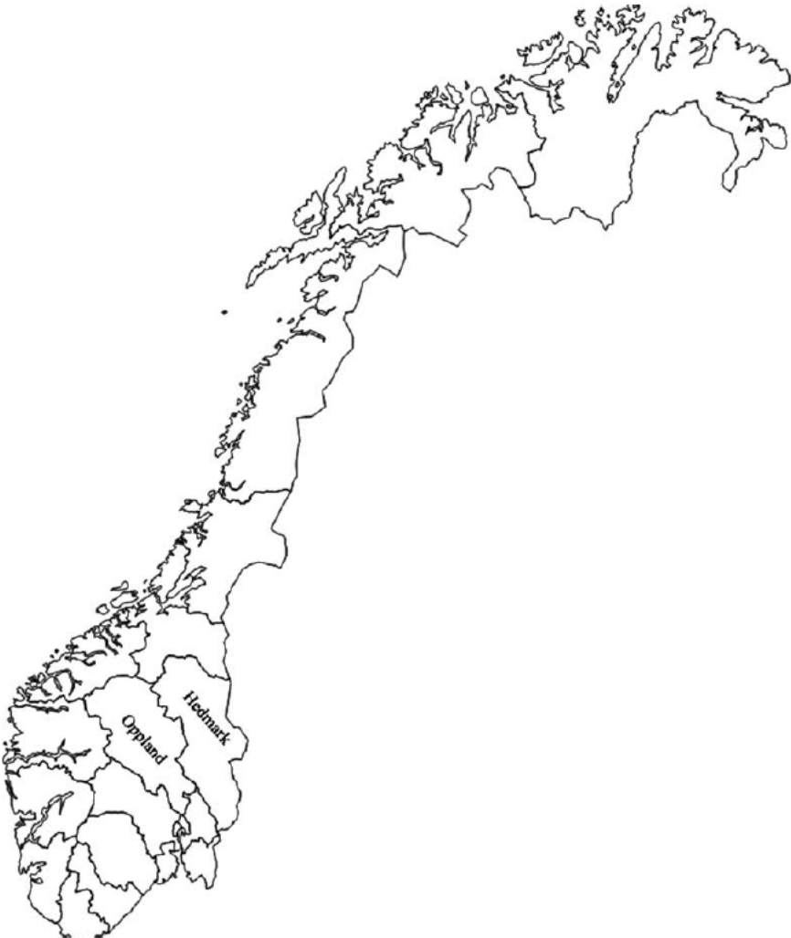
Figure 1. Locations of Hedmark and Oppland counties in Norway.