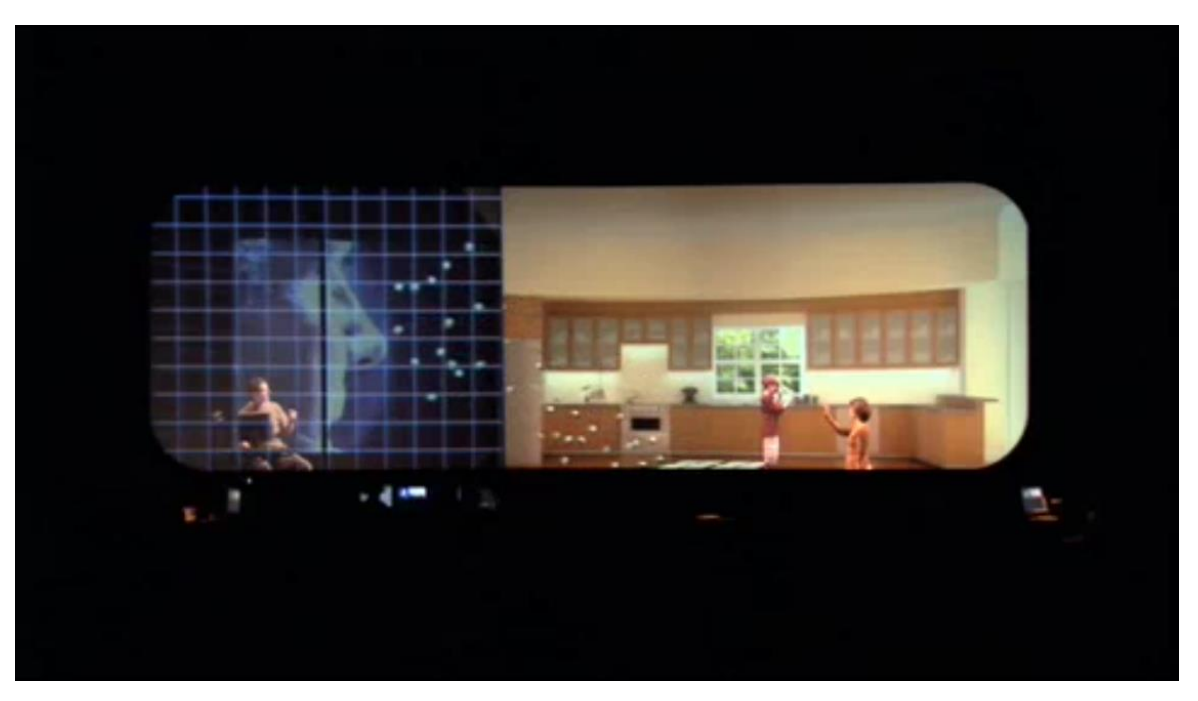
Figure 2. The scene from interaction with digital son.