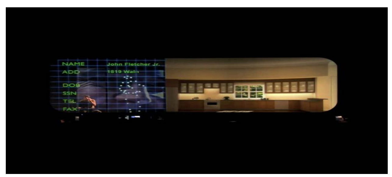
Figure 1. The scene from the first part of the performance.

Liveness of this part interconnects with mediatized space. The audience can see real actors on the stage, which interact with each other. At the same time digital created son reminds us about virtual reality in this part of performance. In my theoretical part I mentioned problematic issues connected with liveness. Some theorists admit the existence only a pure liveness of the performance, others speak about impossibility of division liveness from media