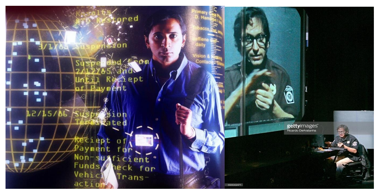
Figure 3. The scene from the second part of the performance.