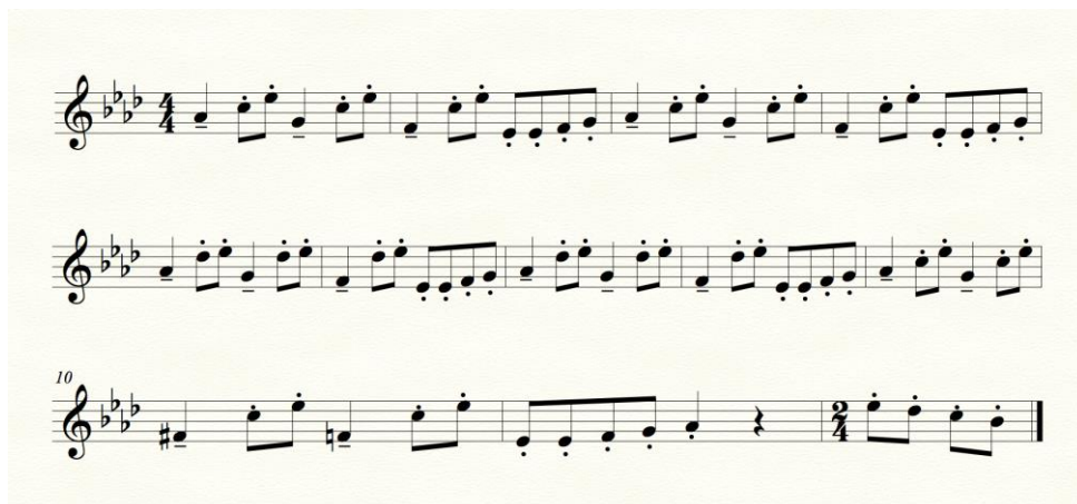
Electric guitar motif in “Ge mej mera köttbullar”

Allan F. Moore, in his book, Song Means (2012), made a useful distinction between persona and environment in recorded music, defining the environment by how it relates to the persona in different ways. According to Moore, “(T)he impact an environment can have on the persona can range from the significant to the trivial, as accompanimental textures, harmonies and forms serve both subtle and blatant functions” (p. 191). Taking Moore’s concept of environment to a more detailed level, sonic markers provide a close reading of the sonic features of the songs in question. In short, sonic markers allow the reader to consider the potential effect of these sonic characteristics on the protagonist as well as on the meaning of the song in question. In “Ge mej mera köttbullar,” the music would not appear to relate directly either to the context of the personae or to the theme of the lyrics. Built around a unison bass and guitar motif (Figure 1), and further accompanied by a minimalist drum arrangement, the environment in this song leaves a relatively open space for the vocal expression of the two girls to come through in the mix without much resistance. The dry sound of the electric guitar is significant here, as it could potentially evoke an early 1960s aesthetic, although the song was first released in 1979: