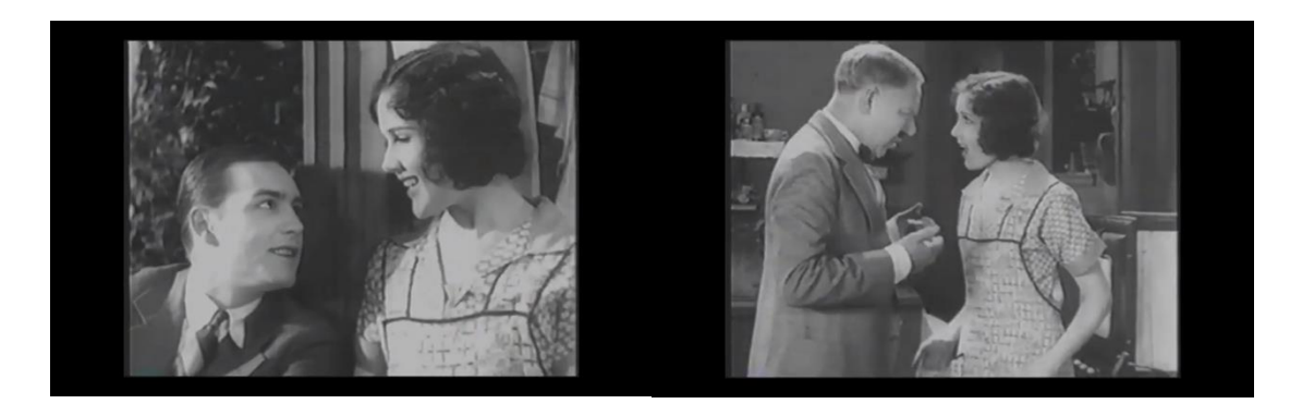
(Fig. 9) The young couple in love. (Fig. 10) Fields daughter, asking for a new dress (Gregory La Cava:1927).

To underline his lack of masculinity, even more, Fields goes to his wife, asks whether he can get some money for the new dress, which she denies without any hesitation. A fight breaks out between his daughter and wife, Fields does not stand up to his wife, jeopardizing his relation to his daughter and his daughter's relationship to the man – No Dress, No Man.