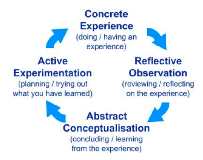
Fig. 1. The experiential learning cycle

These experiences, the change of perceptions and using reflection as a bridge between the transitions can explained by David A. Kolb (1984)[12] experiential learning cycle.