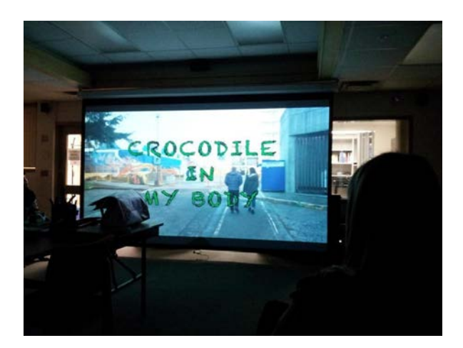
Figure 4: Video adaptation of "Crocodile in My Body," a South African story about the prevalence of HIV in sub-Saharan Africa (2015).

Canadian teachers have also been introduced to the stories as tools for teaching foreign languages. For example, at a 2016 workshop for teachers of Chinese as a Foreign Language held in Vancouver, teachers learned how a combination of bilingual, monolingual, wordless, and pictureless stories could be used for a variety of communicative classroom activities. Some examples of these activities include working in groups to create a new story based on pictures in a wordless storybook; creating images to illustrate the story in a pictureless storybook; looking for patterns in a bilingual story to increase language awareness (either with a language that students are not familiar with or with their first language); and back-translating monolingual versions of the stories and comparing them with existing translations.