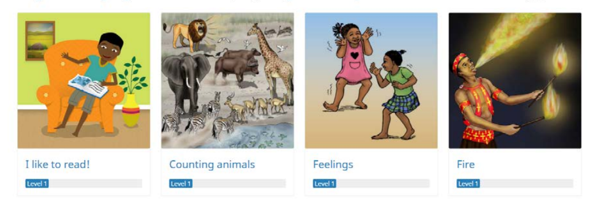
Figure 1. The Storybooks Canada website

Storybooks Canada is designed specifically for teachers, parents, and community members. It makes 40 stories from the African Storybook available with text and audio in English and French, as well as the most widely spoken immigrant and refugee languages of Canada. We also celebrate Indigenous languages and are developing Indigenous Storybooks Canada. Share and enjoy!