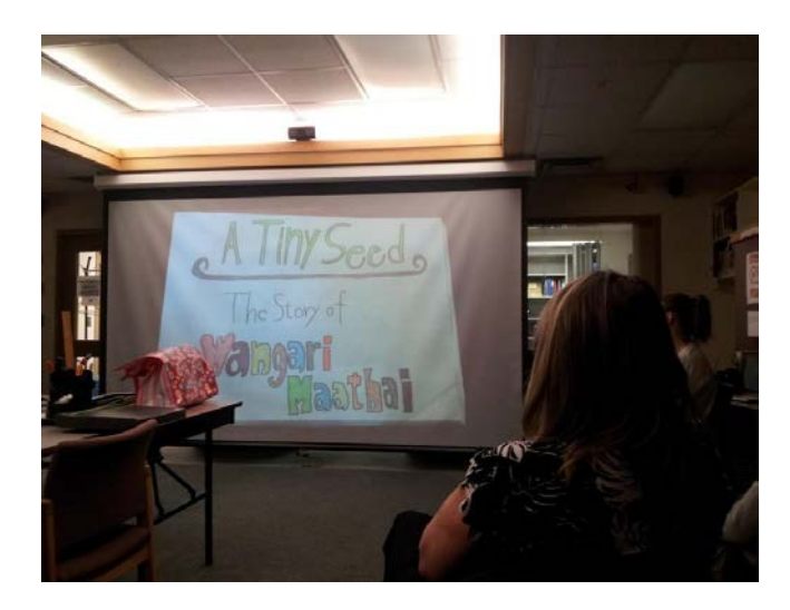
Figure 2: Film adaptation of "A Tiny Seed: The Story of Wangari Maathai" (2015).

(which deals with HIV in sub-Saharan Africa; see Figure 3) into Japanese as well as intersemiotic live and video performances (see Figure 4).