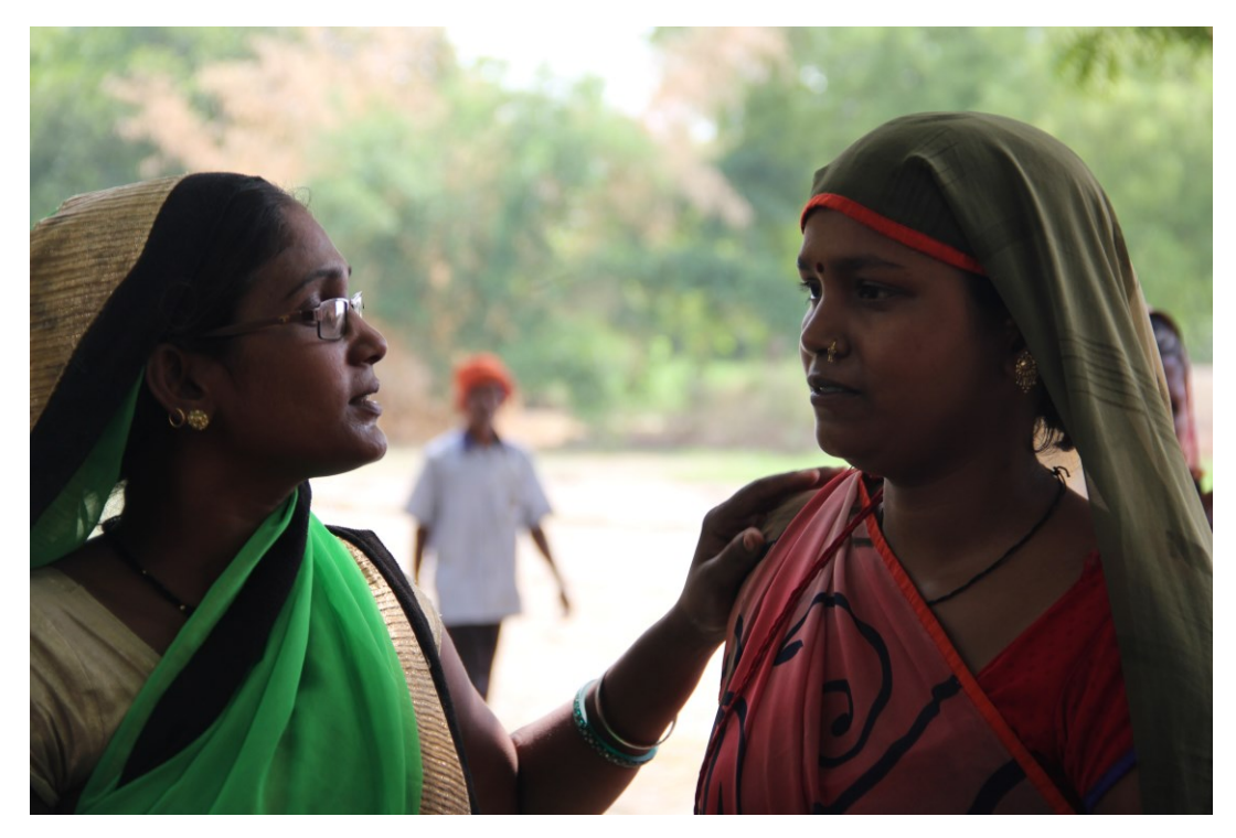
Photo 3: PD Entrepreneurs Seek out Peer Social Support for Personal and Business Purposes.