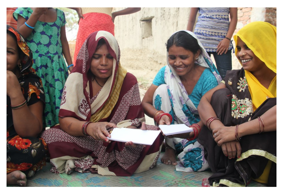
Photo 1: Through Patte , a Card-Sorting Game, the Uncommon Behaviours of PD Entrepreneurs were Discovered.

The next step was to identify which of these 306 behaviours represented highly uncommon practices—ones that contribute to the success of these PD entrepreneurs. An improvised card-sorting game patte (literally "cards") was employed with non-PD entrepreneurs to distill these highly uncommon PD practices.