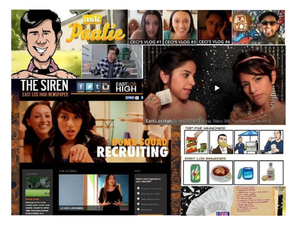
Figure 1. Transmedia Extensions of East Los High Season 1

These nine transmedia narrative experiences were further extended through the resource links and widgets on the East Los High website (Wang & Singhal, 2016) along with other audience engagement strategies on social media such as Facebook and Twitter (Wang et al., 2019). When Season 1 premiered in June 2013, East Los High was consistently one of the most watched Hulu original series and Number One on Hulu Latino with over 1 million monthly viewership (Block, 2013; Castro, 2013; Ramasubramanian, 2016; Terrero, 2014).