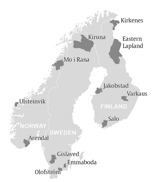
Figure 2. Location of regions. map layout by Linda Stihl.

Third, in each region, we conducted an in-depth study following an identical methodology with shared interview guides and interview protocols (Grillitsch et al., 2021b). The investigation started with an extensive desktop study of scientific publications, policy reports, planning documents, newspaper archives, and websites of relevant organizations. Using these data, a timeline was created of important events related to the observed outlier periods. Desktop research was also used to identify the actors that could be associated with these events. In explorative interviews, the events timeline was validated and corrected if necessary, and the list of key actors was complemented.