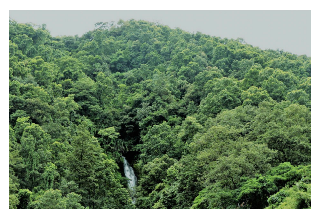
Image 1. A section of the forest patch where the young Binturong was released.

Austin, S.C. (2002). Ecology of sympatric carnivores in Khao Yai National