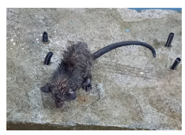
Image 2b. Young Binturong with an almost as long tail as head and body together.