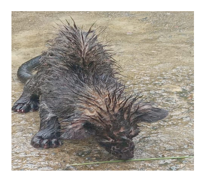
Image 2c. Young Binturong (note the long shaggy black to brown coat, light white frosting on the body, tufted ears, long white whiskers forming a peculiar radiated circle round the face, five-toed feet with large strong claws).