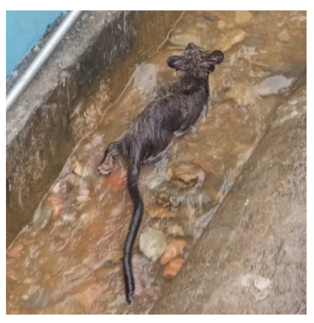
Image 2a. Young Binturong in a flooded drainage where the animal was first located showing bare sole a characteristic of the civets.

Park, Thailand. PhD dissertation, Texas A&M University-Kingsville and Texas A&M University, xv+153 pp.