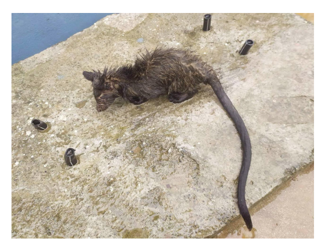
Image 2d. Young Binturong's lateral view showing a long prehensile tail gradually tapering and slightly curling inwards at the tip.

Datta, A. (1999). Small carnivores in two protected areas of Arunachal Pradesh. Journal of the Bombay Natural History Society 96(3): 399–404.