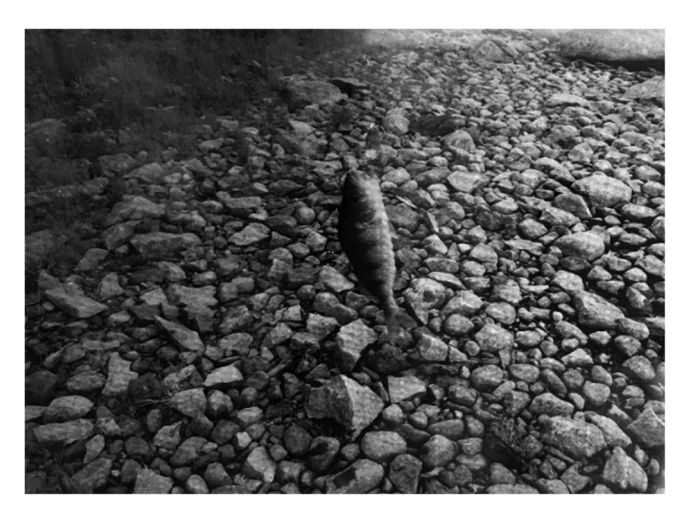
Figure 5. Photo taken by a 21-year-old man from Belgium.