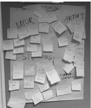
Figure 1. Interviews, workshop and output from the co-design process.