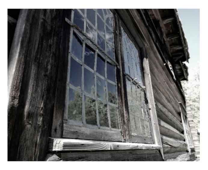
Figure 3. Photo taken by a 64-year-old man from Norway.

Well, when we are back in Georgia where we live, at some of the more popular lakes ... a lot of people leave their trash, garbage, bottles and cans ... you will see it like on the beaches you know ... so that will probably be the biggest thing for me, it is so beautiful and clean right now, you will hate to see trash, garbage you know.