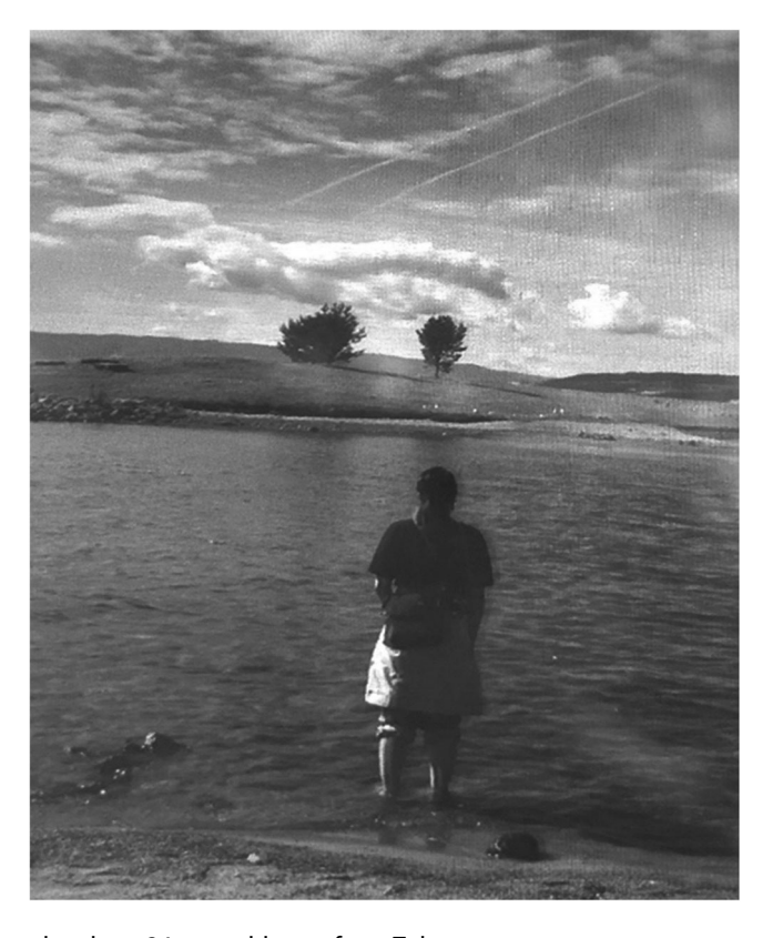
Figure 2. Photo taken by a 24-year-old man from Tokyo.

Many interviewees were concerned about the natural environment. Emergent issues were "too much garbage", "water pollution", "factories near the lake" and "climate change". A visitor from the US state of Georgia noted: