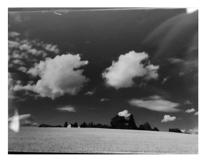
Figure 4. Photo taken by a 46-year-old woman from Norway.

At the same time, some interviewees were concerned about "traffic noise", "too many tourists", "not preserving the viewpoints", and "overgrowth of the cultural landscape":