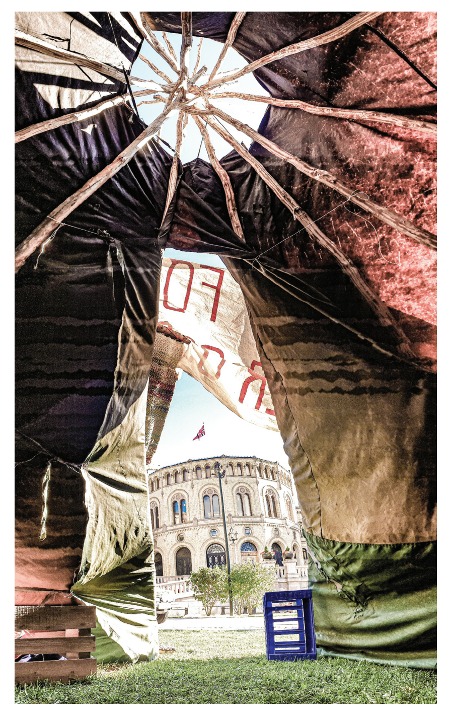
Figure 3 A view towards the Norwegian Parliament building from within a traditional Sámi tent ( lavvu ). Taken during the cast of the hunger strike action for the film Ellos eatnu – la elva leve (released 2023).